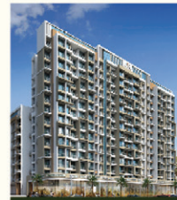
SAI VRINDAVAN, KARANJADE