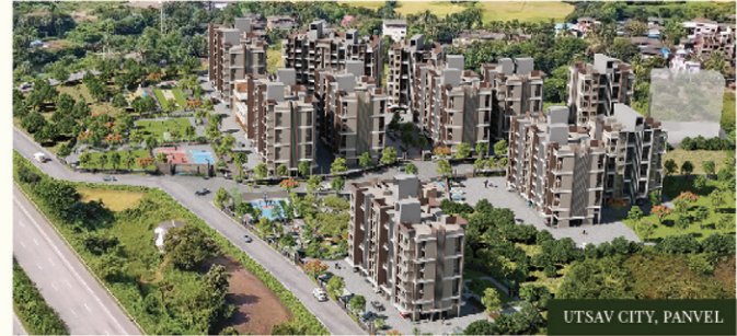
UTSAV CITY, PANVEL