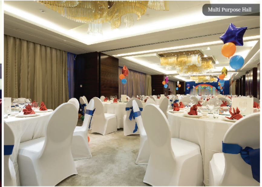
Multi Purpose Hall