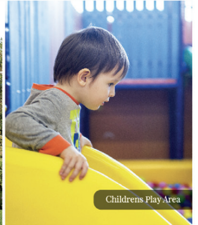
Childrens Play Area