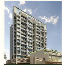
SHREE SAHEBA, KAMOTHE