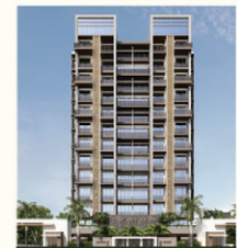
GRAND VISTA, ULWE